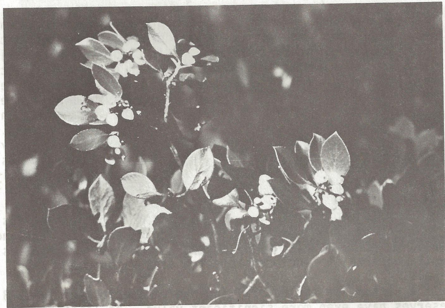
CLOSEUP OF A. hookeri

Arctostaphylos hookeri (Monterey manzanita)