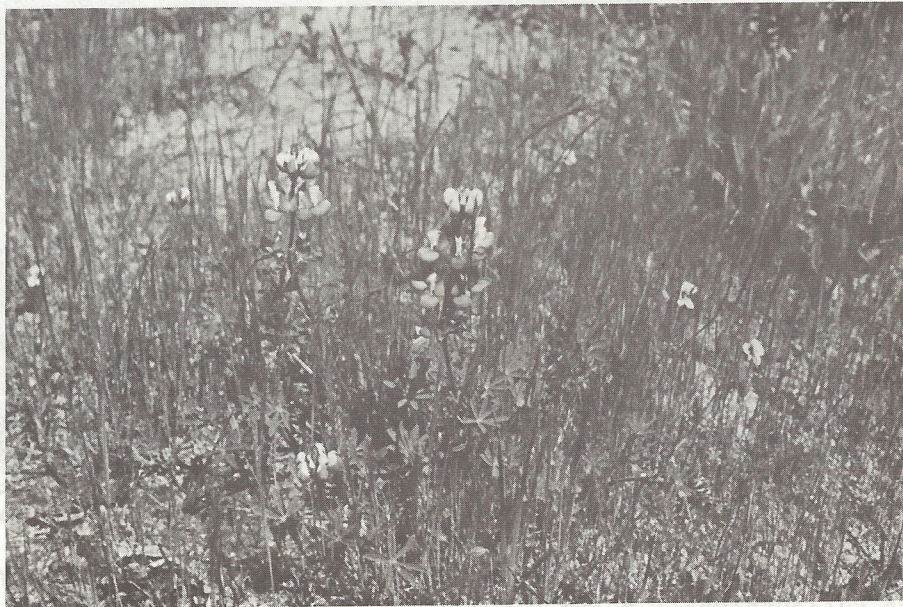
SKY LUPINE, THE MOST ABUNDANT WILDFLOWER AT FORT ORD

The following pages tell a story in pictures of the drama in color that unfolds every year within Fort Ord's boundaries . . .